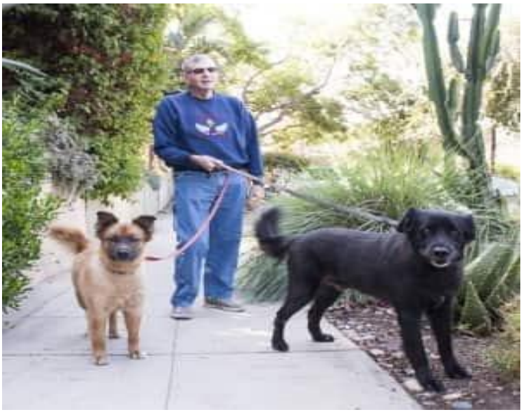
Fig. 2. Routine exercise for pet animal